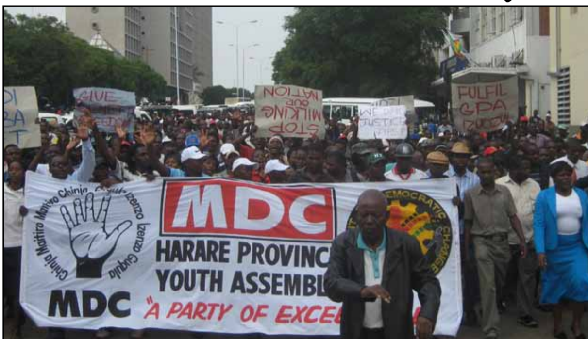
Thousands of MDC supporters march in central Harare last Friday demanding an end to impunity

Some sobriety returned after former South Africa President Thabo Mbeki struck a deal for President Tsvangirai, who had won elections in March 2008, to incorporate the loser Mugabe in a coalition government, but not before hundreds had died and the thousands others forced to seek refuge in and outside the country.