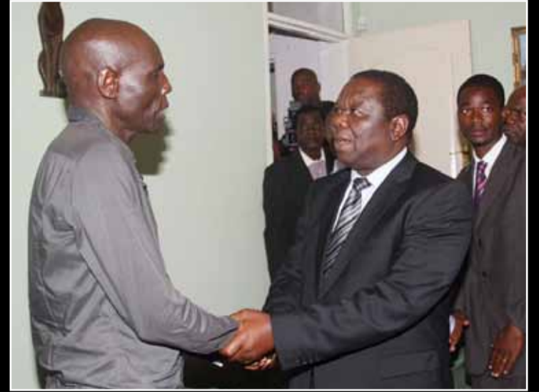
President Tsvangirai consoles a grieving Oliver Mtukudzi