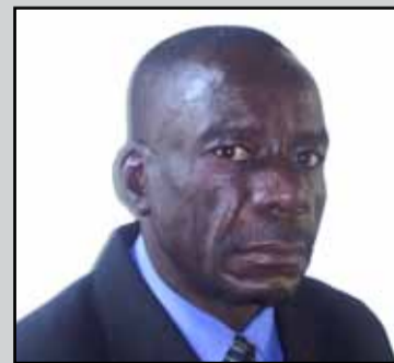
Hon. Edmore Maramwidze

HARARE - The MP for Gutu South in Masvingo, Hon. Edmore Maramwidze who was facing trumped-up charges of abusing government subsidized agricultural inputs, has been acquitted.