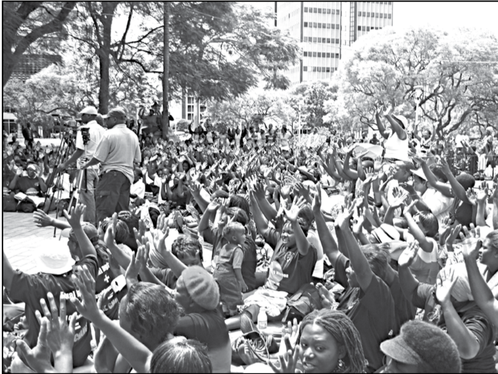
Members of the MDC Women's Assembly hold their celebrations on Sunday at Africa Unity Square in Harare

Also present at the celebrations were representatives from women organisations, civic society, churches, students and business women.