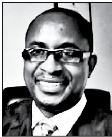
Senator Obert Gutu

Whilst during the day Zanu PF functionaries talk of national healing and nation building, they Nicodemously spread messages of hate and intolerance. They preach the "gospel" of violence and thuggery. They will talk of so-called "sanctions" until their voices are hoarse.