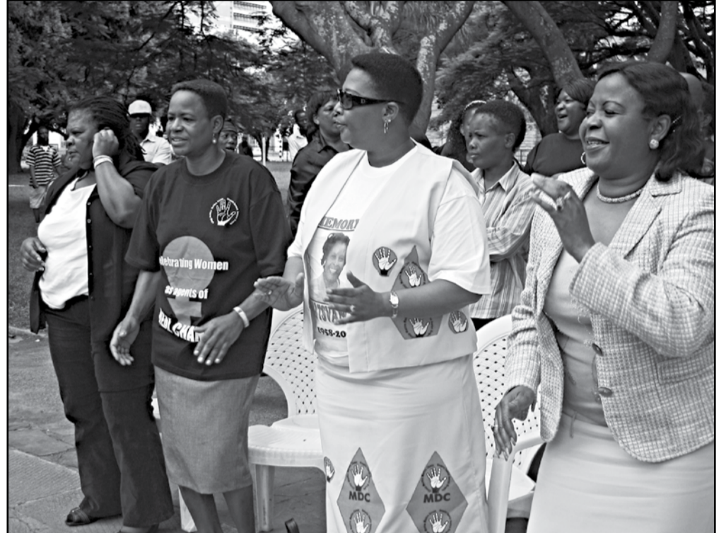
Vice President Hon. Thokozani Khupe and the MDC Womens Assembly leadership mark International Womens Day