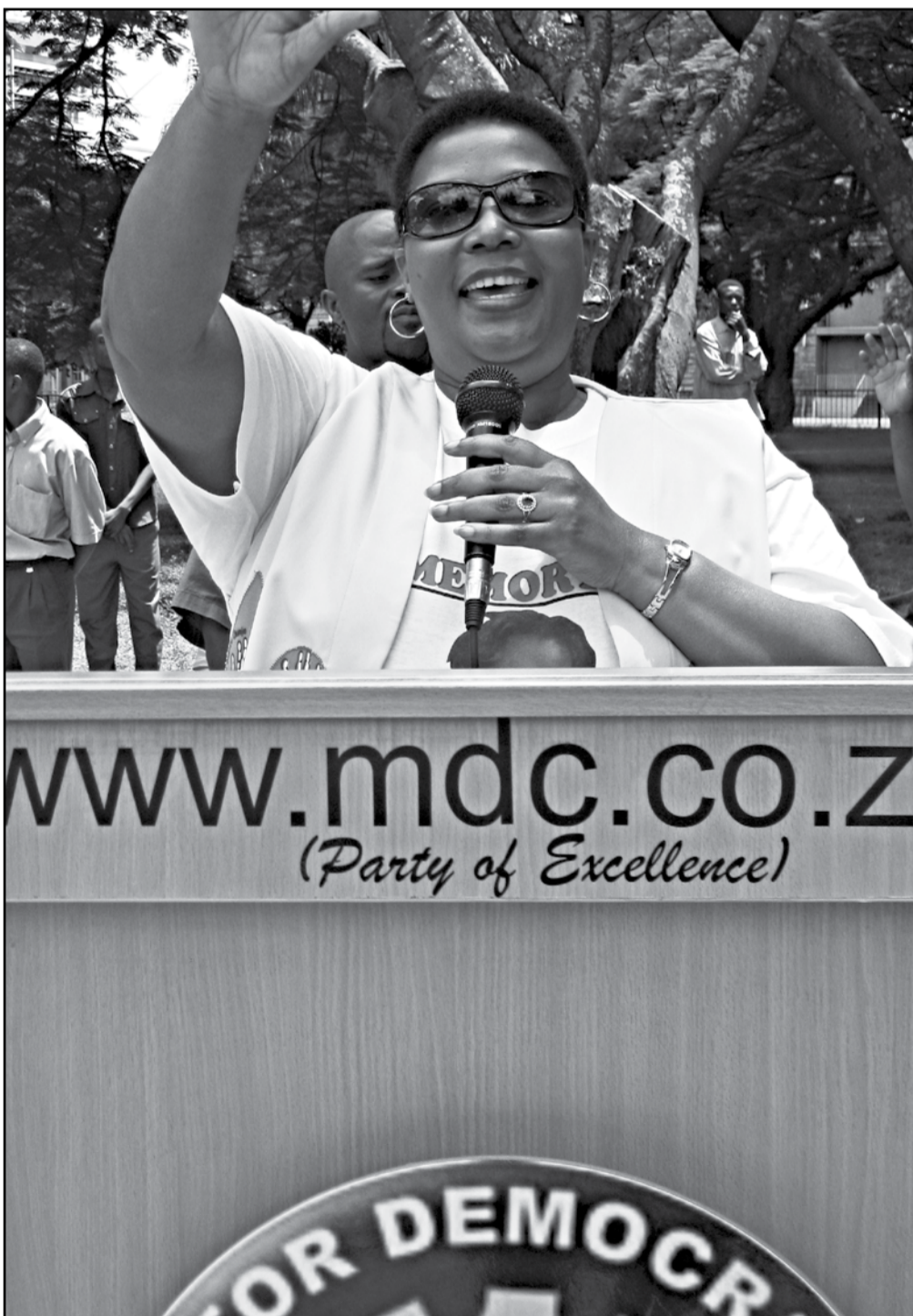
MDC Vice President and deputy Prime Minister Thokozani Khupe addresses the gathering at Africa Unity Square